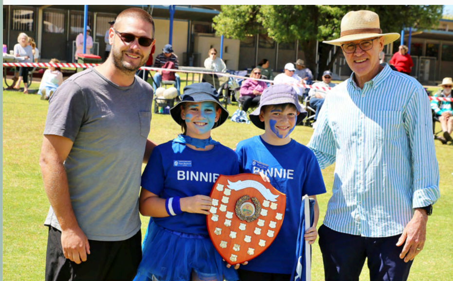
House Captains of Binnie receiving the Marching Shield