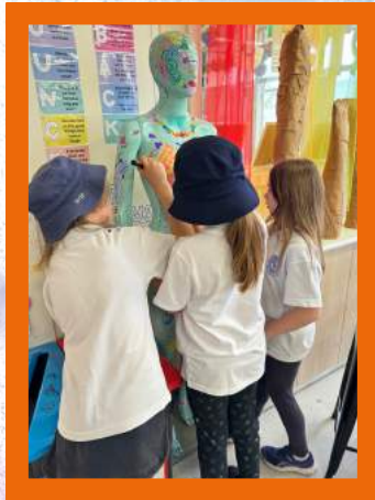
Decorating our classroom mannequin using paint pens.