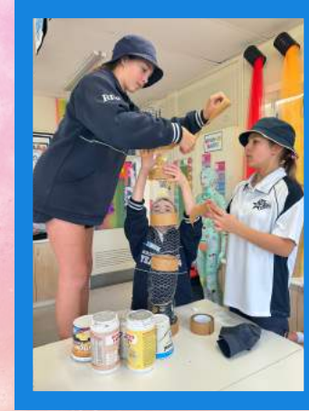
Working on pieces of art for our immersive art experience, which will take place on Thursday 17th October. More information will be sent home during term 3.