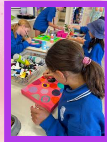
Painting so many circles on canvases, ready for the Year 3/4 classes to use as part of their collaborative project with the residents of Charla Lodge later this term.