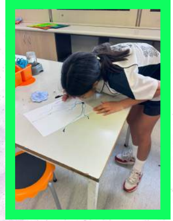
Working on individual, interest based art projects.