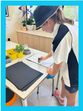
Mounting the junior primary classes pieces of art work ready to be displayed,