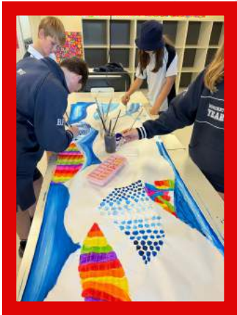
Painting sections of a large banner, which will form part of the new signage for the front of the school.