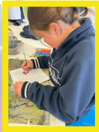
Working on our term 2 art club project, which will be framed and displayed in the front office.