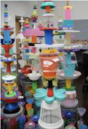
Sculptures we hope to create with unwanted kitchen ware