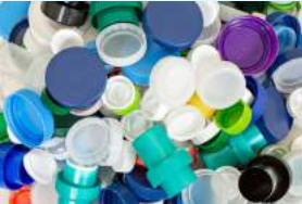
Bottle tops, lids and caps of all shapes and sizes

All donations are greatly appreciated and can be delivered to the front office.