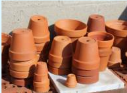
Clay, terracotta pots