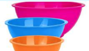
Plastic kitchen ware Cups, bowls, platters, serving bowls, mixing bowls, strainers, jugs, plates etc.