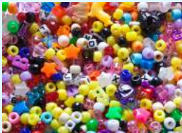
All types of threading beads