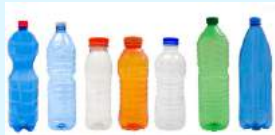
Plastic drink bottles All shapes, colours and sizes