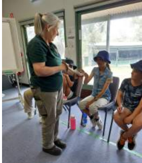
Cleland Wildlife Park